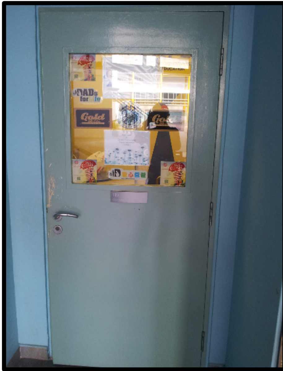
PSG Room (Near Level 1 Lift Lobby)